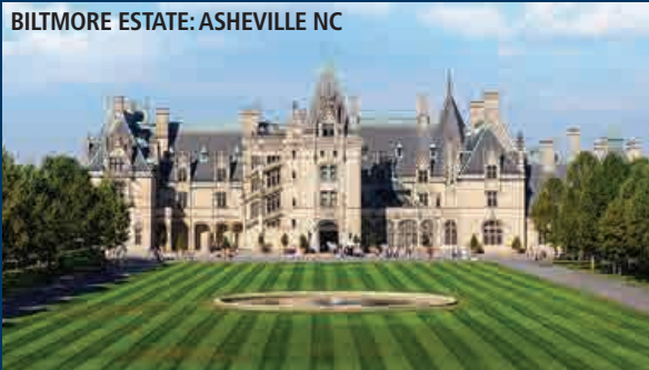
BILTMORE ESTATE: ASHEVILLE NC